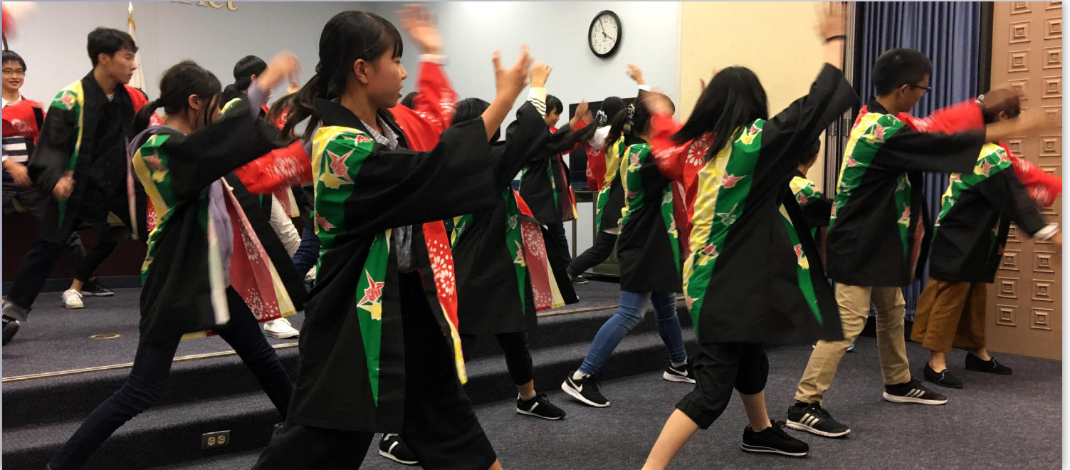
The Japanese middle school students from Kakamigahara, Japan performed the traditional harvest dance in the Welcoming Reception. Arigato!

On November 2, we welcomed over 30 Japanese middle school students from the City of Kakamigahara, Japan. This is part of our Sister School-District agreement with the City of Kakamigahara, Japan that has been in effect since 2000. The guest Japanese students were paired with their host families from throughout the District. The guest students performed a dance during the Welcome Orientation at the District Office. ▶