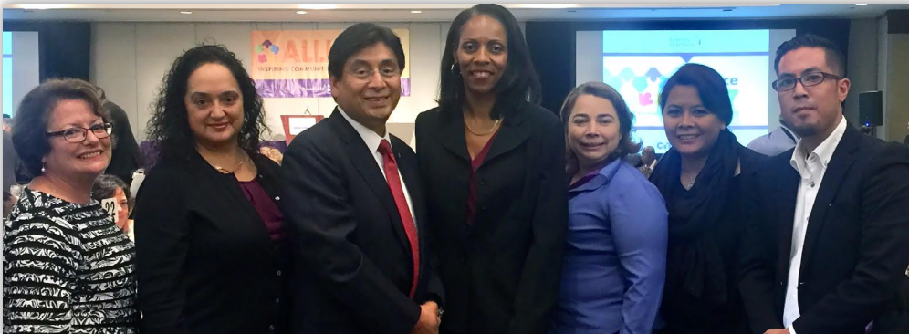
6 th Annual Excellence in Parent Engagement Award