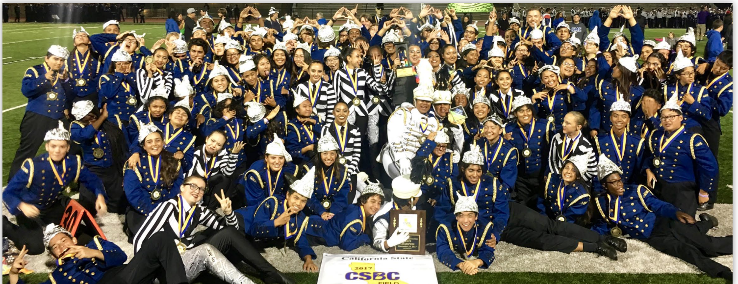
Gahr HS Marching Gladiators named the California State Band Champions for the fourth consecutive year!